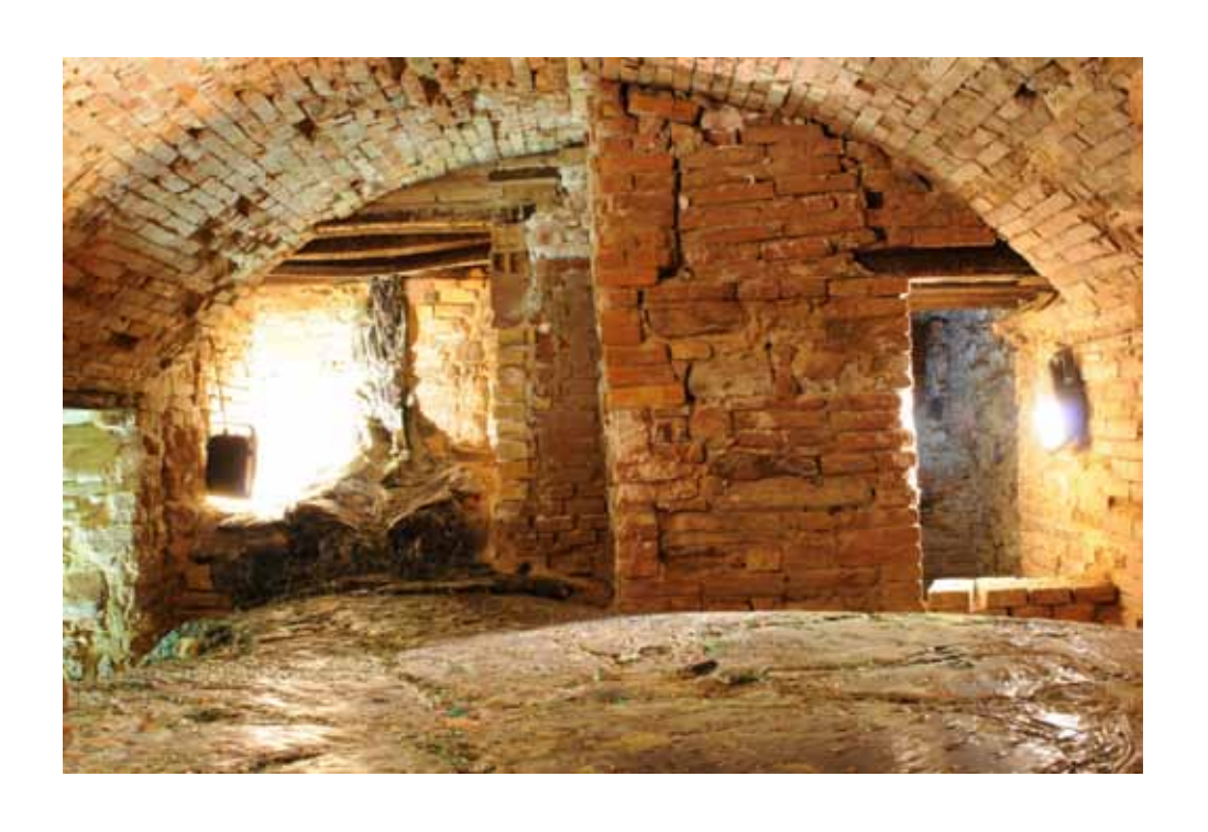
Fig. 2 - The big cast of glass conserved on the basement floor of the museum.